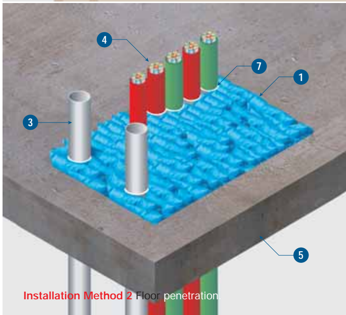
Installation Method 2 Floor penetration.

PROMASEAL® Pillows are normally installed by laying in courses to completely fill the penetrations. Where required to effect adequate overlap, the smaller sized pillow may be used at ends of layers of pillows.